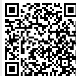
"How You Can Prepare"